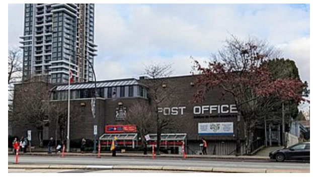
CUPW strikers outside a <u>Canada Post</u> facility in Surrey, British Columbia in November 2024

Date November 15, 2024 – December 17, 2024